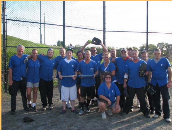
2011 Veterans Inc. Softball Team

This Summer Veterans Inc. staff, veterans, and volunteers from the community participated in the Worcester Health Care Softball League. The season was a success with a regular season record of 11-5 and the team made it into the first round of playoffs!