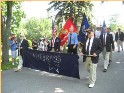
Mobile Education Center.

Shrewsbury, MA Parade - Starts at 9:30AM at the Town Hall