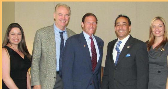
Veterans Inc. staff visit Senator Richard Blumenthal (D-CT) at his office on Capitol Hill

Veterans Inc. attended The National Coalition for Homeless Veterans annual conference from June 6 to June 8, 2011 in Washington, D.C. The conference marked the second year of the current administration's Five-Year Plan to End Homelessness among Veterans and included updates from federal agencies, training on topics across the spectrum of homeless veteran services and issues, and networking with service providers from across the country.