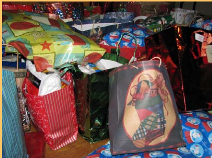
Wish List Donations

Thanks to community members the holidays were brighter for local veterans. Hundreds of gift items from Veterans Inc.'s wish list were generously donated by supporters. Staff members and volunteers were busy in December wrapping all the gifts in time for Christmas. The gifts were handed out to the hundreds