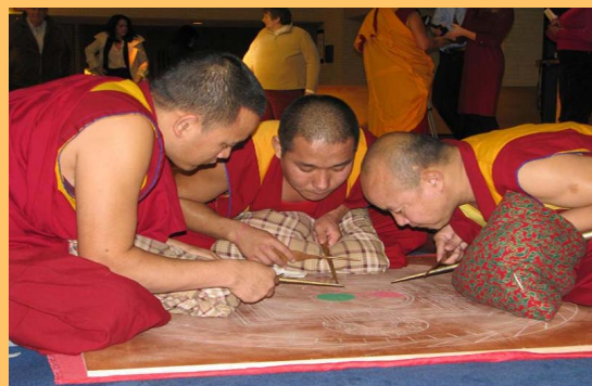
Click Picture to View More Images

Veterans Inc., as part of its Health and Wellness Program welcomed eight Tibetan Buddhist Monks to Independence Hall at 59 South Street in Shrewsbury, MA for a week long experiential event.