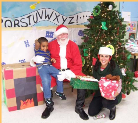
A Special Guest at Little Patriots Early Learning Center, 6 Sheridan Street, Worcester